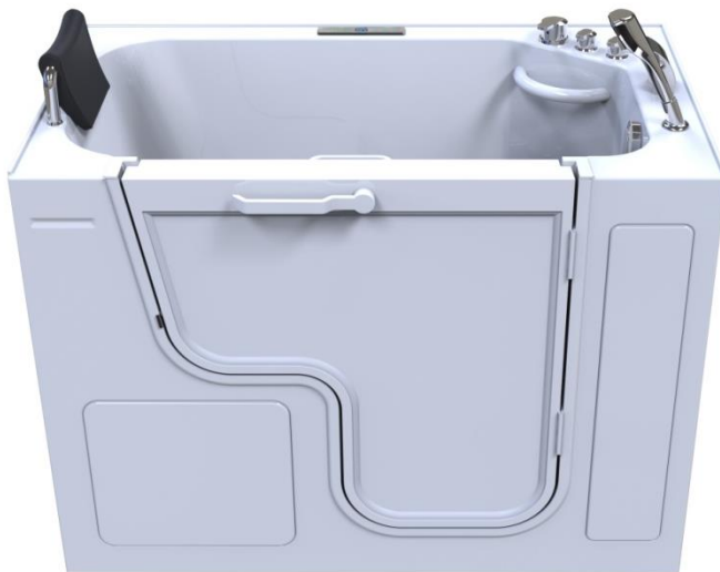
Deluxe Oakham Special 75 Right Hand Shown

In an effort to continually improve our product, specifications and configurations are subject to change without notice.