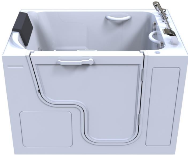
Oakham Plus 89 Right Hand Shown

In an effort to continually improve our product, specifications and configurations are subject to change without notice.